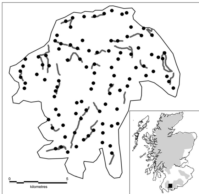
Fig. 1 Location of the study area (black square) and pine marten distribution (grey shaded) in Scotland (inset). Location of hair tubes (black circles) and scat transects (grey lines) within the study area

2010). A total of 100 hair tubes were placed at a density of one tube per 1 km 2 Ordnance Survey grid square throughout the study area, with approximately 1 km spacing between each tube where practicable (see Fig. 1). Grid squares that had less than 50 % forest cover and those without vehicle tracks for easy access were excluded. Hair tubes were installed within 10 m of the forest track and were fixed vertically to the trunk of a tree using wire, approximately 1 m off the ground. Two patches of ‘mouse glue’ (Pest Control Supermarket, http://www.pestcontrolsupermarket.com ) cut to 1 cm × 1.4 cm rectangles and stuck with double-sided sticky tape to blocks of 4-mm thick Correx Board measuring 2 cm × 2.5 cm were fitted to the base of the tube to catch hair when an animal entered. Tubes were baited with chicken meat attached to the inside of the tube lid with wire or string. Four sampling sessions were conducted, with tubes sampled between 5 and 9 days apart over a total of 32 days. During each sampling session, any glue patches that had collected a hair sample were removed and placed in a plastic sample pot, labelled with a unique sample number and subsequently frozen at −4 °C within 12 h of collection. Fresh glue patches were fitted and fresh bait was installed in the tube on each occasion when patches were removed.